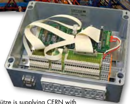
Lütze is supplying CERN with 100 housing units

The results are easy to see: The housing has been successfully tested and put into operation in the experimental cavern of the ATLAS to the full satisfaction of CERN.